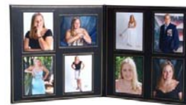
4x5 Folio shown

Pricing subject to change without notice Pricing does not include PA Sales Tax